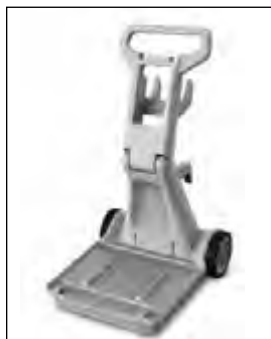
Caddy Cart – RC3400CC included with Model RC3431CUY (sold separately with Model RC3431CU)

NOTE: *Tile may require foam roller option