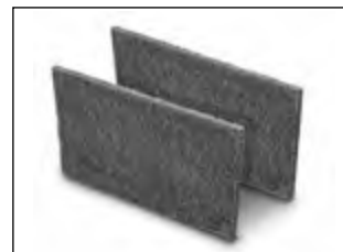
Spring Clean-up Filter Elements for heavier debris – RCX70103PAK2 (sold separately)