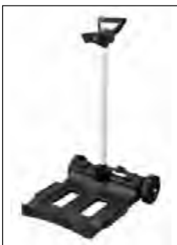
Caddy Cart – RC97385D included with Model RC9742CUBY and RC9742WCCUBY (sold separately with Model RC9740CUB and RC9740WCCUB)