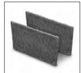
Spring Clean-up Filter Elements for heavier debris – RCX70103PAK2 (sold separately)

*Replacement parts for older TigerShark, TigerShark QC and TigerShark Plus whole good cleaner models see pages 250–251. Replacement parts for new whole good cleaner models are not included in this Buyer's Guide 2016 edition but are available for viewing online at Hayward.com.