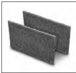
Spring Clean-up Filter Elements for heavier debris – RCX70103PAK2 (sold separately)