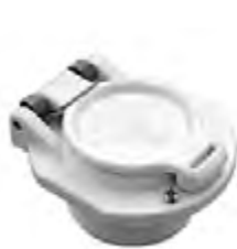
VacLock™ Safety Wall Fitting

View Suction Cleaner Accessories on pages 69 and 70.