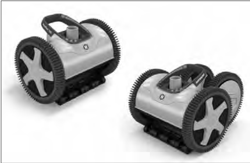
AquaNaut 200 & 400

AUTOMATIC SUCTION CLEANERS WITH V-FLEX™ TECHNOLOGY