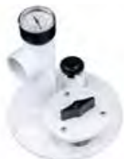
Skimmer Vacuum Plate