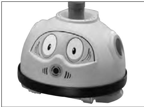
700 Diver Dave