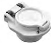
VacLock™ Safety Wall Fitting