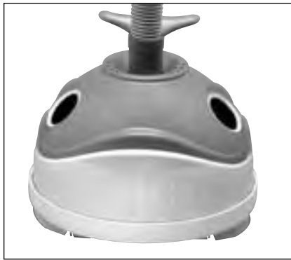
900 Wanda the Whale