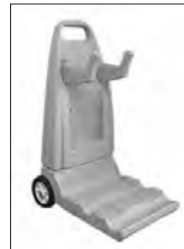
Optional Premium Caddy Cart – RC99385 (sold separately)